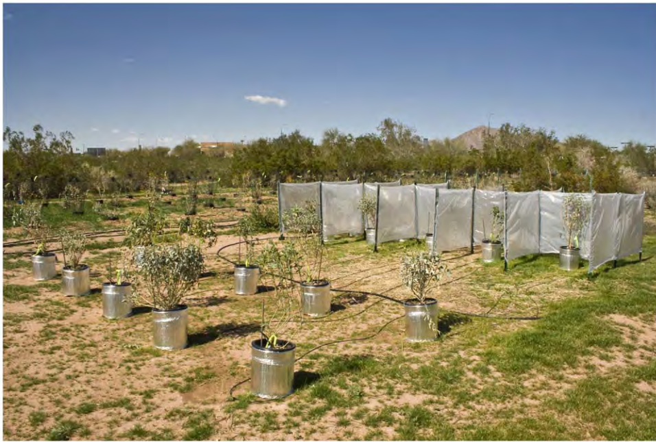
Figure 3. Experimental setup. The windbreak at one of the desert remnant locations. Exposed plants in the foreground and sheltered plants in the back. The plants were in insulated 5-gallon pots ( \approx 18.9 L) with individual drip irrigation ensuring optimal water availability. doi:10.1371/journal.pone.0011061.g003

and annuals growing around the pots and windbreak were regularly removed to improve air circulation.